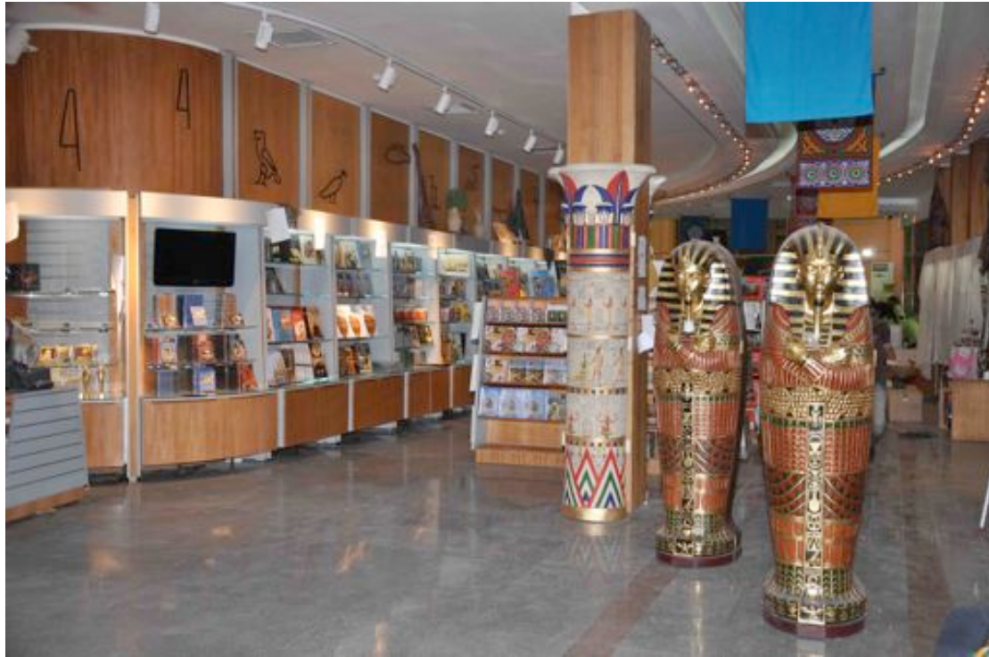
An interior view of the now opened bookstore at the Egyptian Museum. As part of the new tourist route, visitors will exit into this bookstore and gift shop.