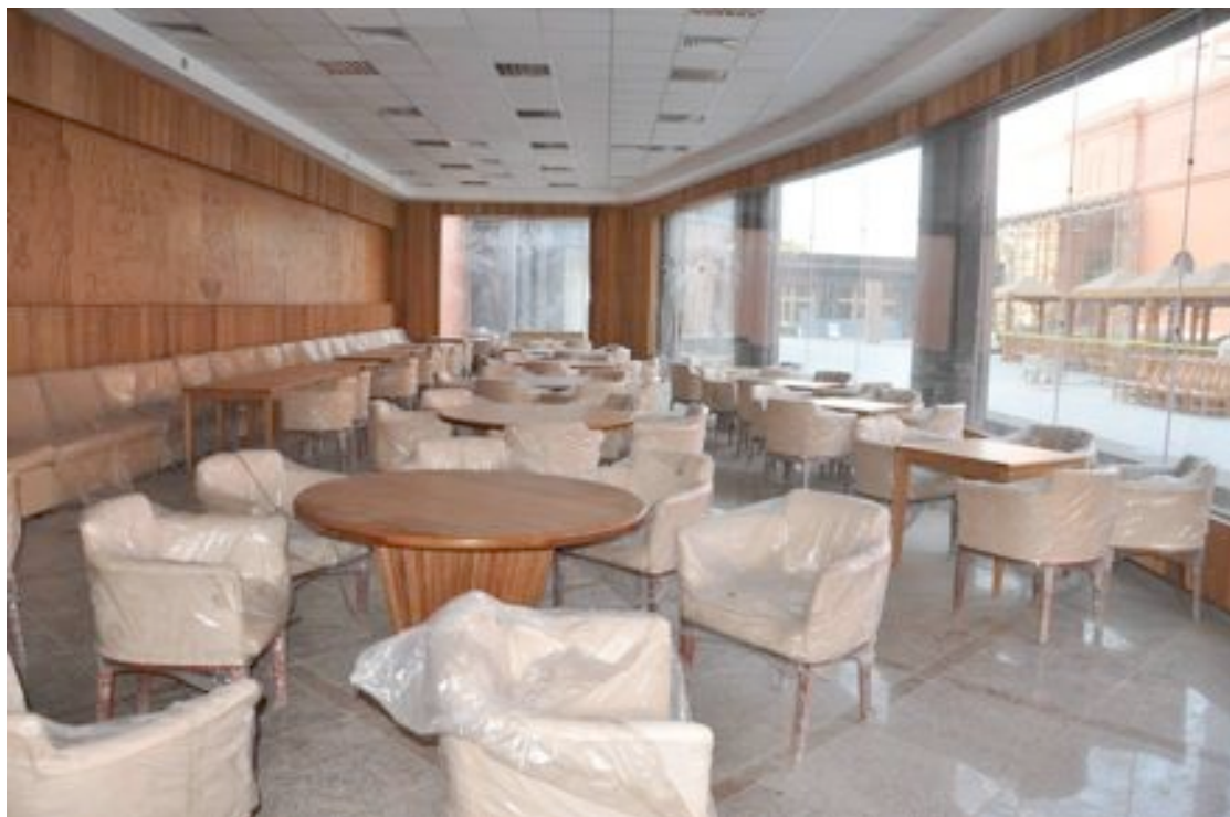
An interior view of the restaurant at the Egyptian Museum. This restaurant will be part of the new visitor's center, which is being constructed as part of the Egyptian Museum Development Project.