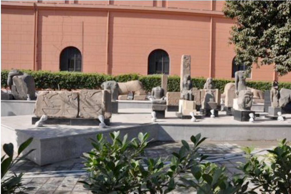
Day view of the open-air permanent exhibition. Several pieces of statuary and architectural elements can be seen in this photograph.