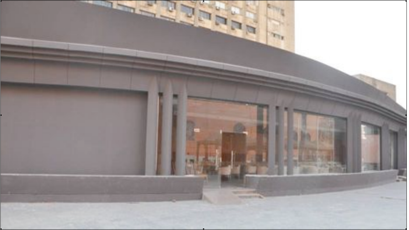
The façade of the new restaurant on the western side of the Egyptian Museum.